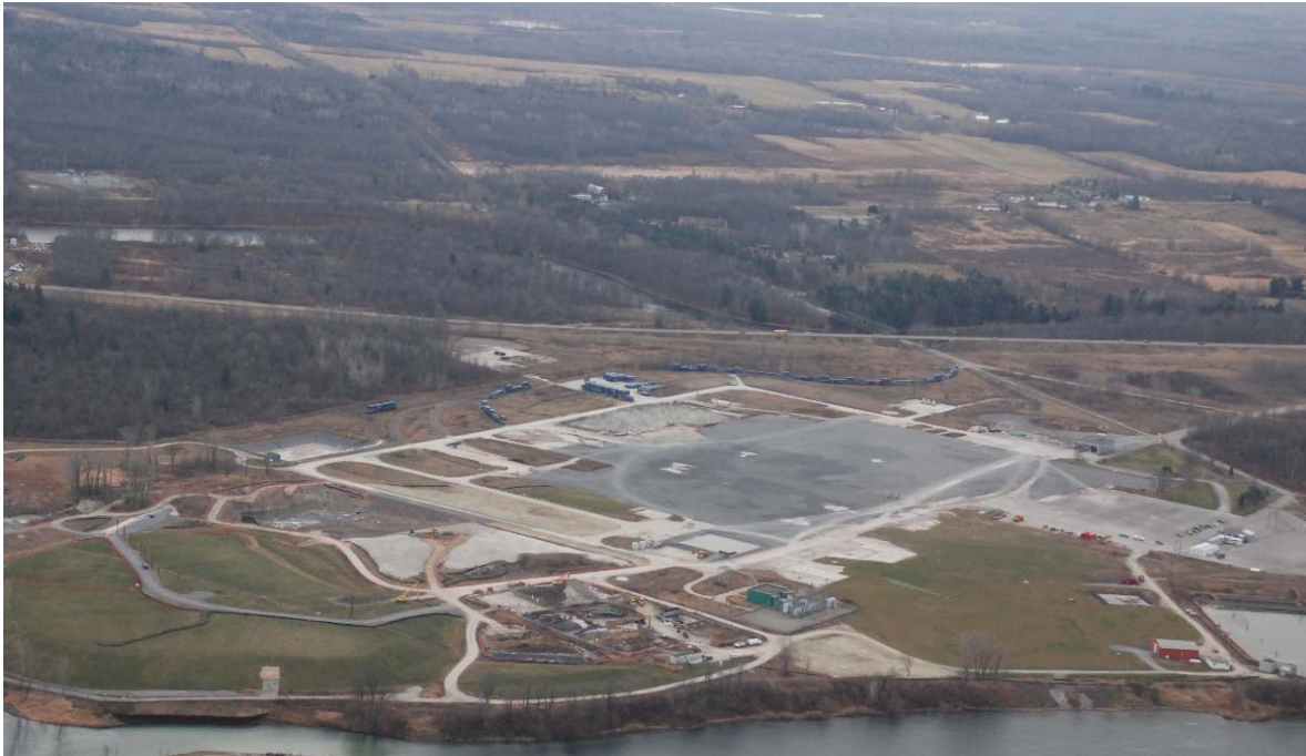
GM Massena BOA Study Area – view from north

Develop a Revitalization Plan for the former General Motors Massena site